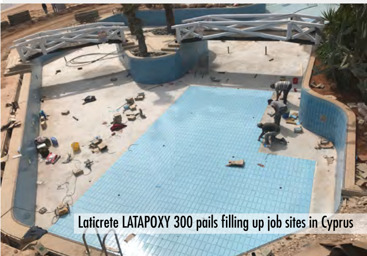
Laticrete LATAPOXY 300 pails filling up job sites in Cyprus